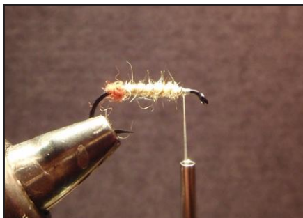
Steps 3 & 4