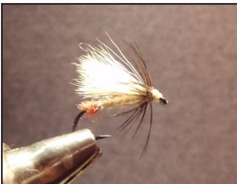
Bill's Swimming Starling Sally Dry