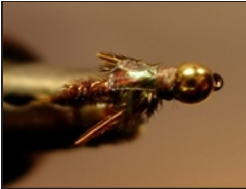
Beadhead Flashback Swimming PT