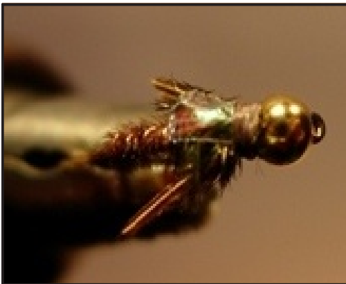
Steps 8, 9 & 10