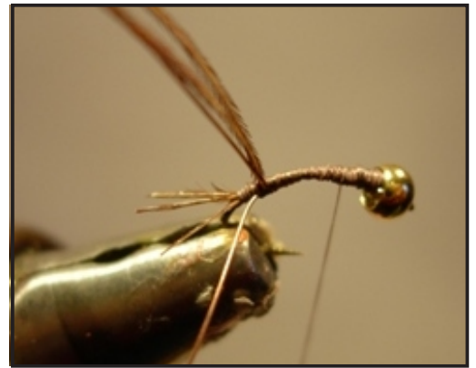
Steps 2 & 3