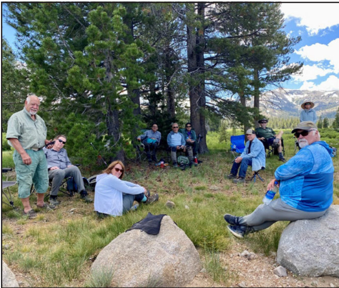
Lunchtime at the Upper West Carson fishout June 2024

Here are a couple of photos from several events this year: