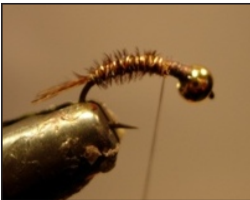
Steps 4 & 5