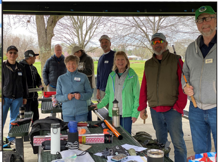
Tenkara Workshop March 2024

So, if you own a tenkara rod or are just interested, there are several ways to be involved with other club members that own rods. If you have a rod, but haven't been using it much, consider the several ways to expand your skill set, learn about more streams that are wonderful for tenkara, or just want to be with others fishing tenkara more. There are lots of opportunities. It's a great way to supplement your river or lake fishing, with time on a mountain stream! See you at some tenkara events in 2025!