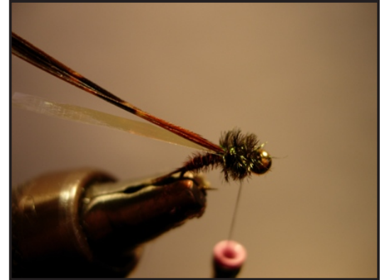
Steps 6 & 7