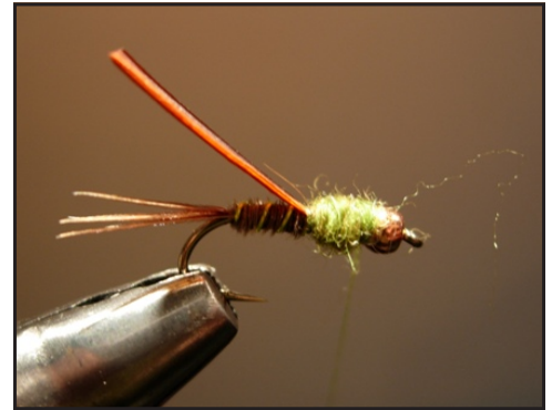
Steps 4 & 5