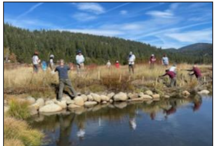
Working on the streambank

Once we were done with the planting, we headed over to a fair taking place at the Granite Flat Campground, where we were fed lunch and were able to view the booths that were set up there. After finishing lunch, we