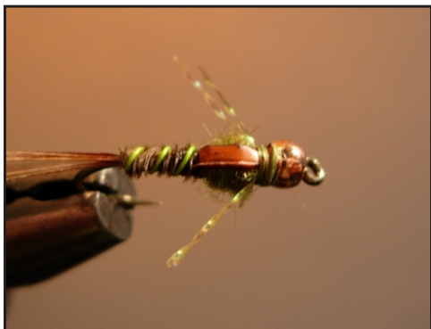
Hogan's S & M Nymph