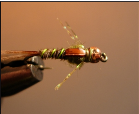
Steps 6 & 7