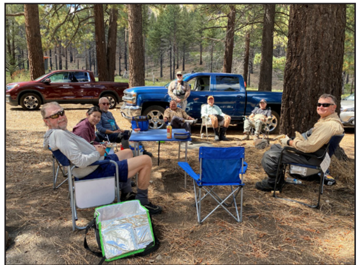
East Carson fishout, September 2023

So, if you own a tenkara rod, or are just interested, there are several ways to be involved with other club members that own rods. If you have a rod, but haven't been using it much, consider the several ways to expand your skill set, learn about more streams that are wonderful for tenkara, or just want to be with others fishing tenkara more, there are lots of opportunities. It's a great way to supplement your river or lake fishing, with time on a mountain stream!