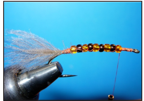
Steps 3 & 4