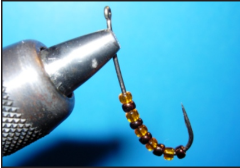
Steps 1 & 2