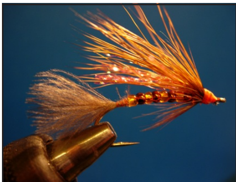
Bill's Emerging Thing