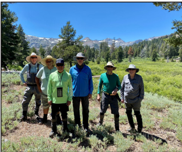
Upper West Carson fishout, July 2023

Here are photos from a couple of fishouts this year: