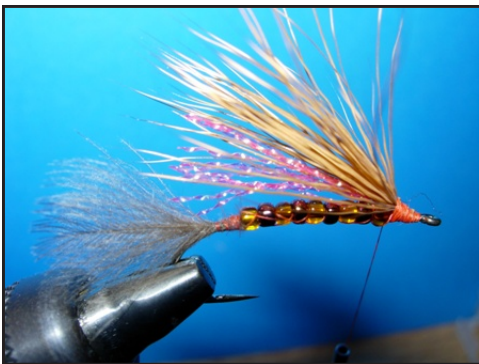
Steps 5 & 6