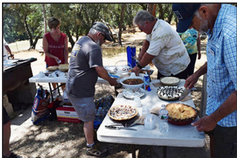
Let there be pies!