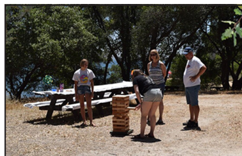
Sure, I can remove one more block