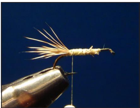
Steps 1 & 2

For best viewing: (1) Maximize your Computer Screen Window. (2) Type "Ctrl + or -" to enlarge or contract the photograph display. (3) Use the Horizontal and Vertical Scroll Bars to scroll right and up/down to display larger photos on your screen.