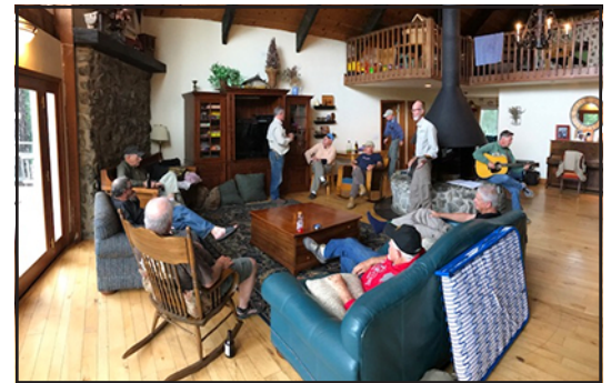
Lazing at the cabin

it at that. I guess that is all you need to know.