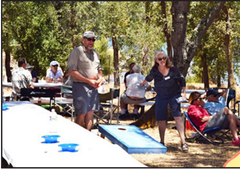
The old bean bag toss

I would like to thank everyone who attended, and all those who helped out with the 2018 Annual Picnic. The picnic was held in the picnic area right outside of our clubhouse. We had 64 people sign-up, and at least 60 people attended.