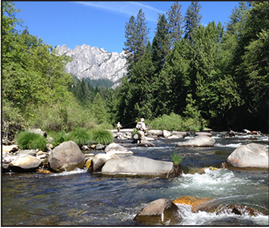
Classic pocket water, only prettier than any place else

A total of twenty anglers were on the trip, making this the largest spring fishout, yet. The fishing continued on Friday, Saturday, and Sunday with the days getting warmer.