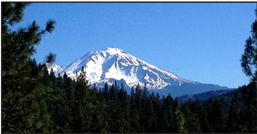
Mt. Shasta from the deck