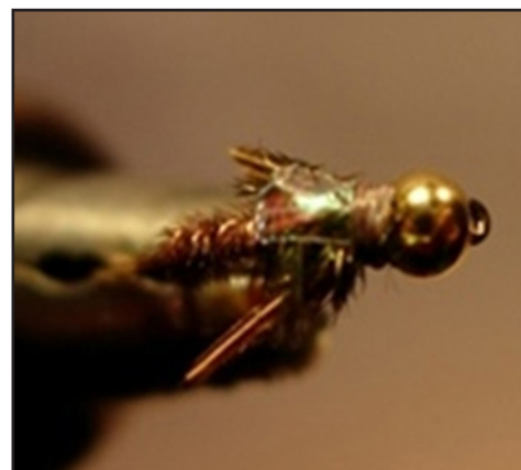
Steps 8, 9, & 10