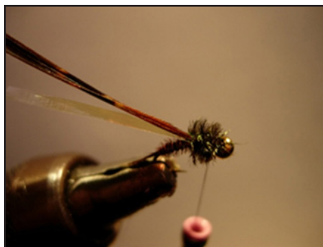
Steps 6 & 7