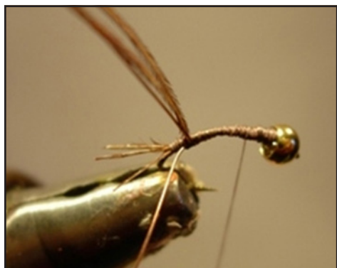
Steps 2 & 3