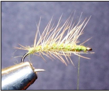
Steps 3 & 4