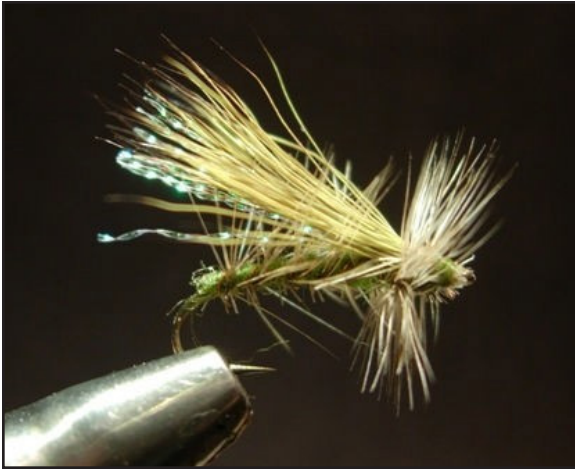
Little Green Stonefly