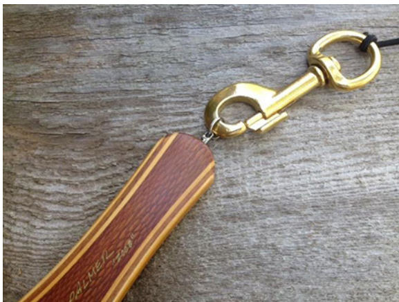
A fail-safe bungee clip

On the way back upstream, I take the more conservative crossing I should have selected earlier, and I