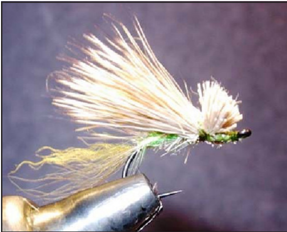
Shambles Caddis II