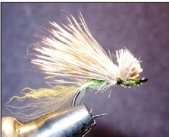
Steps 8, 9, 10 &amp; 11