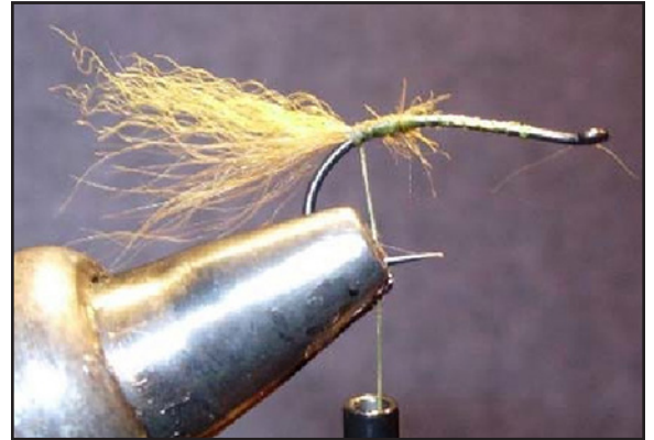
Steps 1, 2 & 3