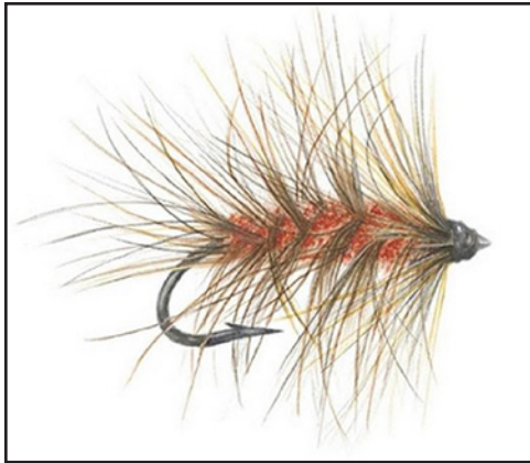
The Palmer—Worm, ca. 1651

So wrote Thomas Barker in 1653, a contemporary of Izaak Walton who also spoke of the fly in his, The Compleat Angler , co-authored with Joseph Cotton, and first published that same year.