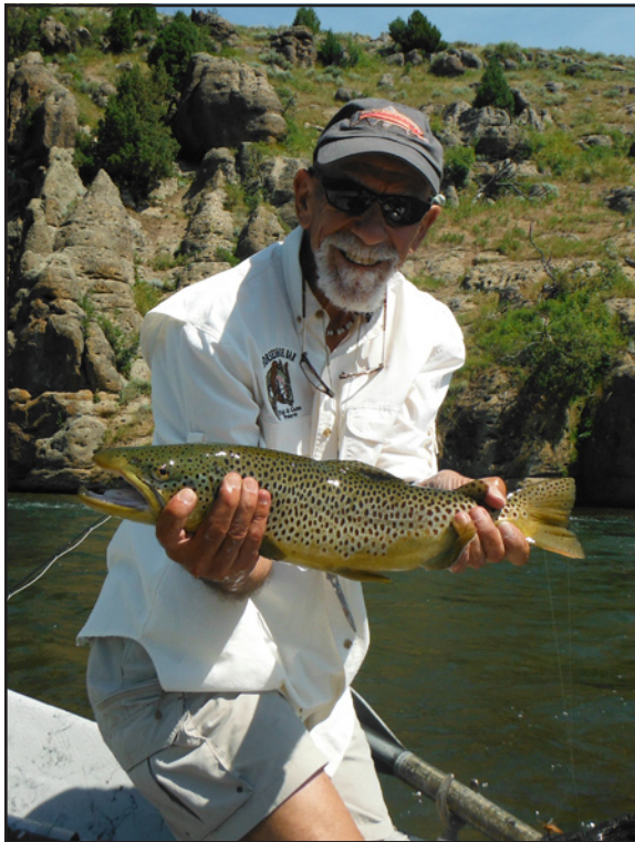
A Day to Remember

As fishermen go, my dad was a master. Those who knew him as I did, who fished with him and tied flies with him, can attest to his wealth of knowledge and persistent mastery of angling skills. That being said, with us, it was never a question of seeking or attaining any kind of mastery. We were students of the art of relentless pursuit. But it was never just about pursuit, either. It was about attention to detail and keen awareness of your surroundings. It was positioning yourself streamside to turn over rocks and at the same time calculating the best possible route to “the spot.” It was the softness of your step into the water, the pinching of the hook barb while tying on your fly, the exactness of the knot, the art of the cast, the sensitivity in your fingertips for the feel of the hit, the quick and precise setting of the hook, the toils of the fight and the cautious finale . . . the landing of the fish. However, it didn’t ever stop there. It continued to the handling of the fish, the removal of the hook from its upper or lower lip, the gentle rocking of the fish in the water’s ripple to help reacclimatize it and lower its stress level when releasing it. It was cleaning your hands, resetting your view of the river, and then readying the fly for the next presentation.