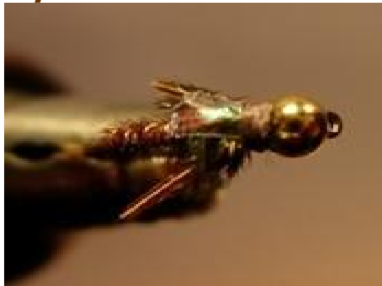
Beadhead Flashback Swimming PT