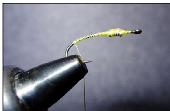
Steps 1 & 2