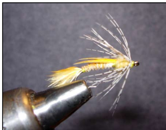
Step 8 Completed Fly

8. Tie in a small partridge feather by its tip and take a couple of wraps in front of the thorax; tie off the feather, and smooth it rearward while wrapping a few more times in front of it. Whip finish.