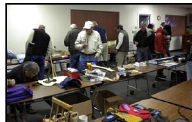
Deals all around.