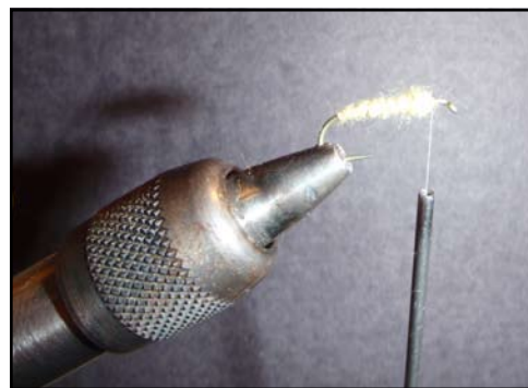
Steps 4 & 5