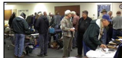
Wheelin', dealin', and eatin' chili.