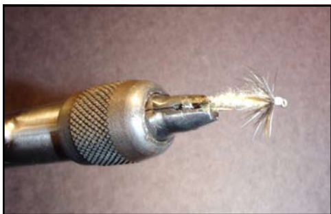
Steps 6 &amp; 7

6. Prepare a starling feather and tie it in by its tip, just in front of the thorax. Since the fly is designed in the soft-hackle style, the concave side of the feather should face the rear of the hook.