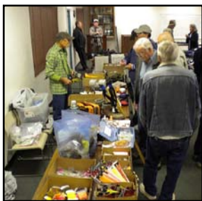
Tying materials at bargain prices.

On the swap meet, many items were exchanged for the legal tender allowing members to off-load once prized and coveted tackle that in earlier years they just could not live with out. There were many bargains to be had from like new high end rods and reels at insane markdowns to older gear at rock bottom prices and everything imaginable in between. Many of our better tiers were selling a wide range