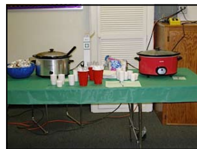
The challenge is on.