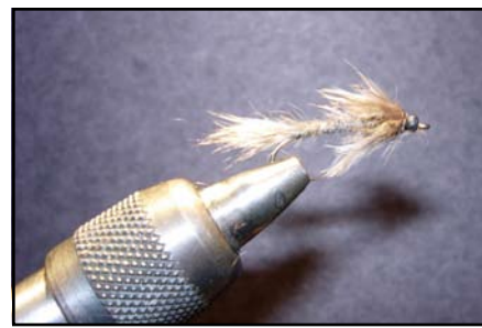
Steps 6, 7, 8 Finished Fly

6. Just behind the eyes, or at the point where the herl thorax ends (if you choose not to use eyes), tie in an immature feather (called an "aftershaft") from a pheasant back; it should be tied in by its tip. You will find these feathers behind the