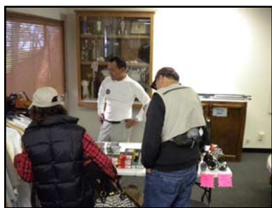
Great, I'm the only vendor here.

The turn-out for the club sellers intent on off-loading new flies, spare, duplicate and unwanted and out grown gear, and buyers seeking same at bargain prices was strong, and people sold and bought a lot of stuff. After an absence of several years, we again invited local fly shops to participate, and Fly Fishing Specialties of Citrus Heights accepted our offer, and seemed pleased with the gear sold at steep markdowns.