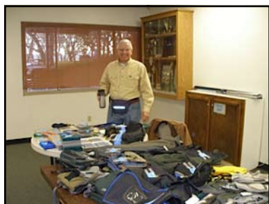
Overflowing with vests.