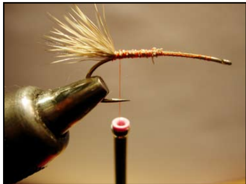
Steps 1 - 4

where the thorax will begin and the wing will be tied in, which is about one third shank length behind the hook eye. Do not use excessive amounts of dubbing—even synthetic dubbing will hold water—and be sure to leave the front third of the hook open as we will need the room for a proper wing.