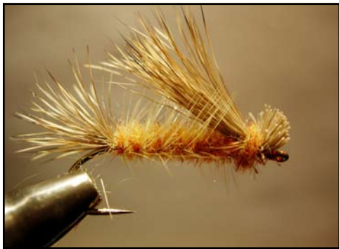
Steps 8 - 10

Fly Tyers Corner - Continued from Page 6