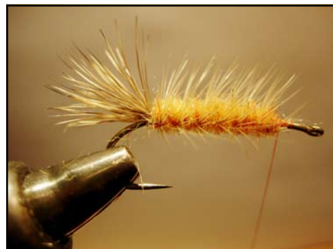
Steps 5 - 7