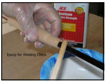
Epoxy for Winding Check

This is the second of two articles providing guidance on gluing rod blank components together with epoxy. Specifically, this article discusses winding check placement and gluing, epoxy cleanup, and clamping the components with masking tape while the epoxy is hardening.