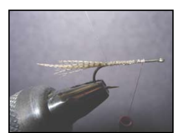
Steps 1, 2 & 3