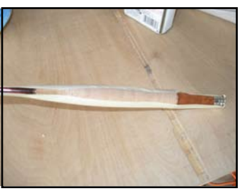
Clamping with Tape

If you are having trouble following these articles, you may find it more enjoyable to take a rod building class to learn these and other steps required to build your own custom rod. If you have any questions or suggestions, please contact Larry Lee at lllee@L3rods.com, www.L3rods.com, or by telephone at (916) 962-0616.