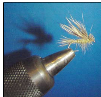
Step 6 and finished fly