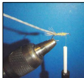
Steps 3 & 4