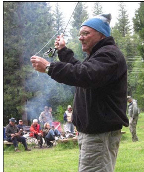
Back Hand Jack