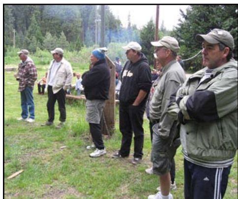
Above: Casting Spectators