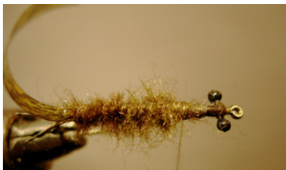
Steps 6 & 7

6. Dub the abdomen—which will be the rear 2/3 of the hook. Use a stiff brush, wire brush, or similar tool to brush out the sides of the body, and pull the dubbing out to the sides with your fingers. Trim the abdomen to a “v” shape (this gives it a nice taper) back to the tail (careful not to cut the tails).