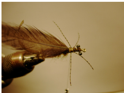
Steps 8 & 9

7. Rib the abdomen, weaving the wire into the dubbing; this gives the dubbing the look of “gills.”