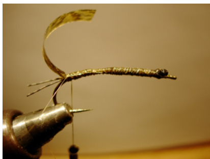
Steps 3, 4 & 5

6. Dub the abdomen—which will be the rear 2/3 of the hook. Use a stiff brush, wire brush, or similar tool to brush out the sides of the body, and pull the dubbing out to the sides with your fingers. Trim the abdomen to a “v” shape (this gives it a nice taper) back to the tail (careful not to cut the tails).