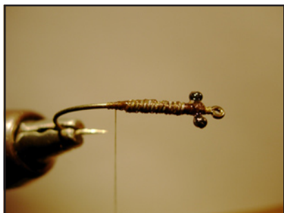
Steps 1 & 2

1. Smash the hook barb unless you are using a barbless version of the hook. Apply 10 wraps of .020 lead wire to the hook. Flatten the wire with flat-nosed pliers; cover the lead with Flexament and thread.