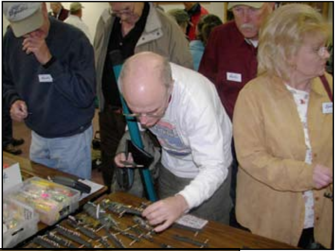
Photos from Swap Meet and Chili Contest Continued from previous page