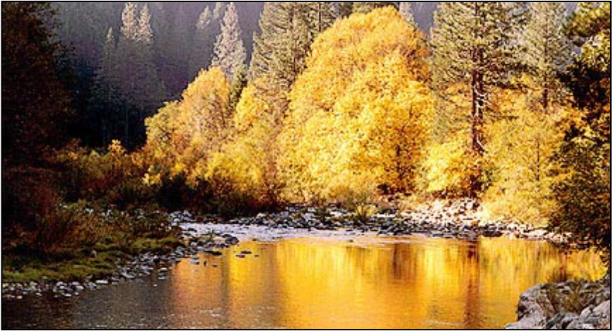
North Yuba river just out of Sierra City.