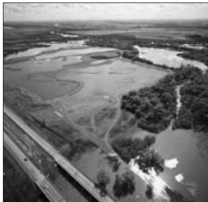
Sacramento Delta waterways