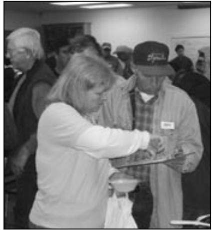
There were many so events to sign-up for...