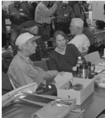
but then theres always time to rest.