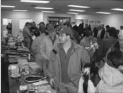
Standing room only for shoppers at the annual swamp meet.