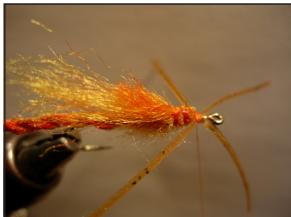
Steps 4 & 5