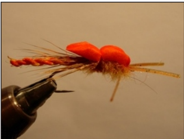
Steps 10, 11 & 12