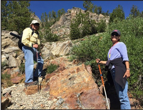
Hiking to Moat Lake

At the Virginia Lakes Fishout every year, we are surrounded by over a dozen pristine lakes, waterfalls, rivers, creeks and some of the most beautiful vistas in the world, let alone in California. This year, we again had a great crowd, beautiful weather and the surrounding mountains were spectacular, as usual. We were visited by eagles and osprey that presented magnificent displays of flying and hunting.