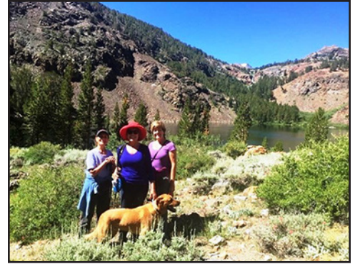
Enjoying the Alpine Beauty

numbers. When folks weren't fishing, they took wonderful hikes and adventures around the area, or just enjoyed the beauty, serenity and great company. Though some members had to leave early, we invited four friends we had made in camp to join us, and had 18 for tacos. If you were not able to attend this year, we sure hope you can next year, and hope all who attended will return.