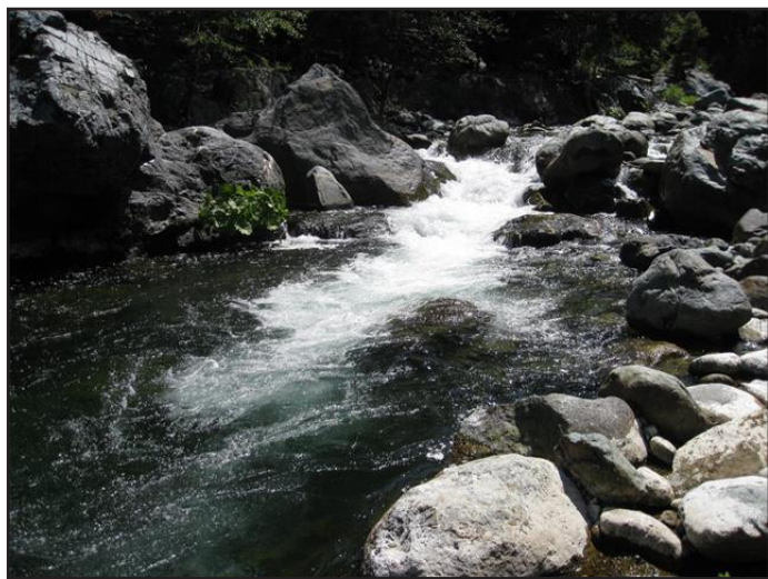
Classic pocket water - N. Yuba River

We are surely blessed here in Northern Cal to have so many high gradient streams, as in the Truckee, N. Yuba, Upper Sac, McCloud, and many more. Why? Fast water. It produces that bubbly, frothy, nervous water tumbling over and around rocks and boulders to form deep pockets under layers of thick white froth that fish crave for cover.