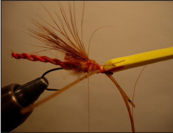
Steps 7 & 8