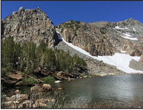
Moat Lake elevation, 10,560'

Virginia Lakes Fishout Report - Continued from page 4