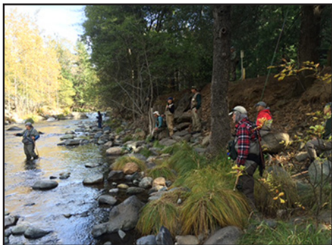
Upper Sac Clinic