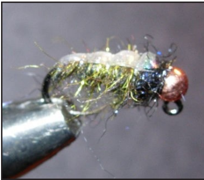
Steps 5, 6 & 7