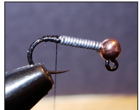
Steps 1 & 2