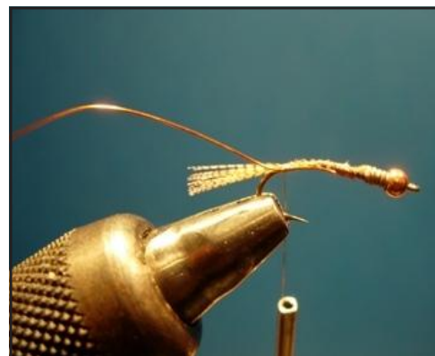
Steps 3 & 4