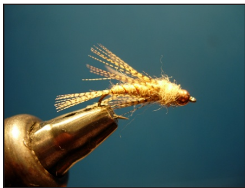
October Birds Nest Nymph