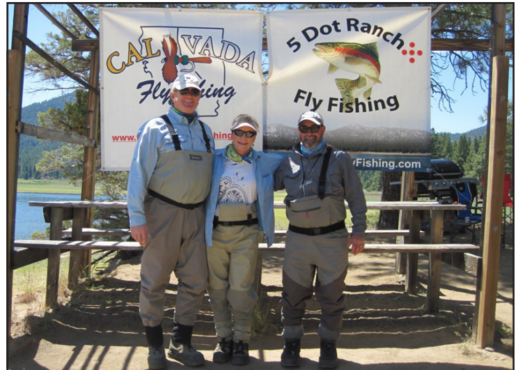
5 Dot Ranch