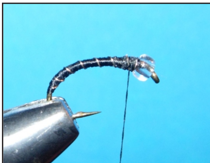
Steps 4 & 5

1. Crimp the hook barb and place the bead on the hook