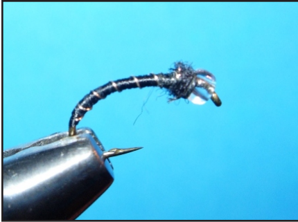
Steps 6 & 7

Fly Tyer's Corner - Continued from Page 11