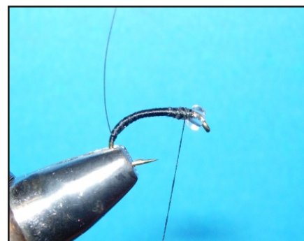
Steps 2 & 3

5. Wrap the ribbing material in even turns up the shank and tie it off behind the bead.