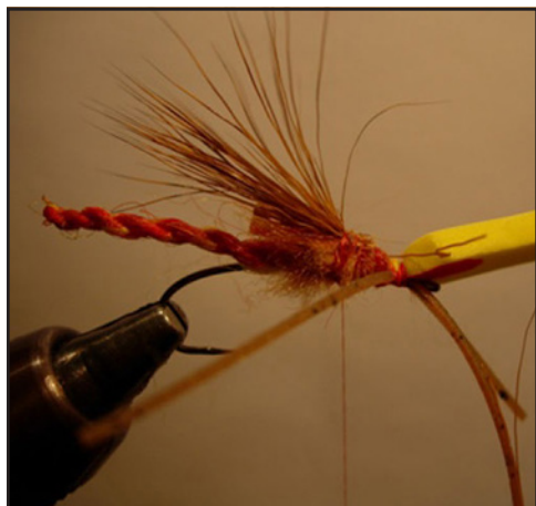
Steps 7 &amp; 8