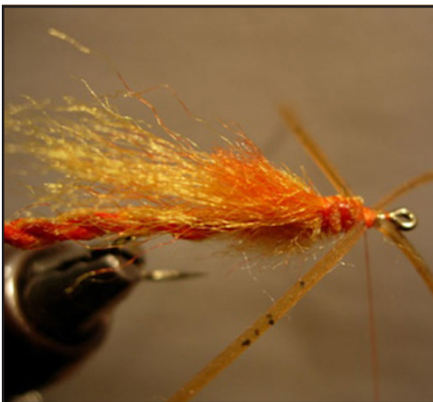
Steps 4 &amp; 5