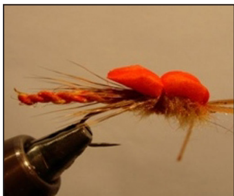
Steps 10, 11 &amp; 12

7. Trim the Antron butts so that they are long enough to reach the point where you tied in the abdomen. This is the underwing.