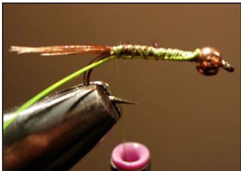
Steps 1 & 2