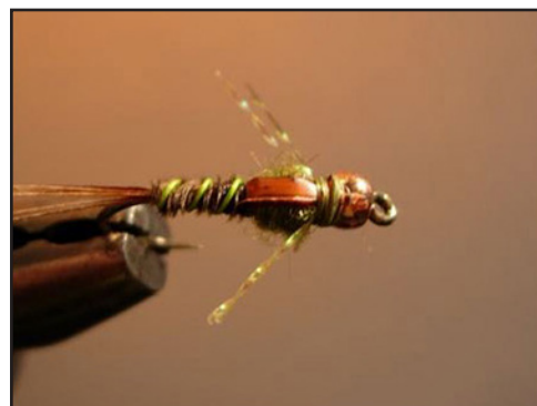
Steps 6 & 7