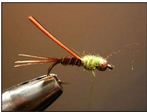
Steps 4 & 5