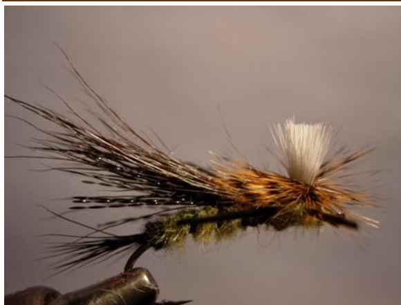
Skwala Stonefly Adult