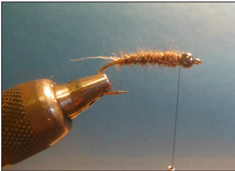
Steps 4 and 5