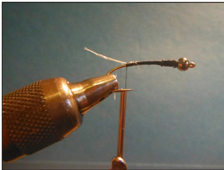
Steps 1 and 2