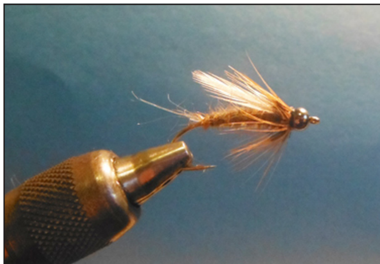
Steps 9 and 10