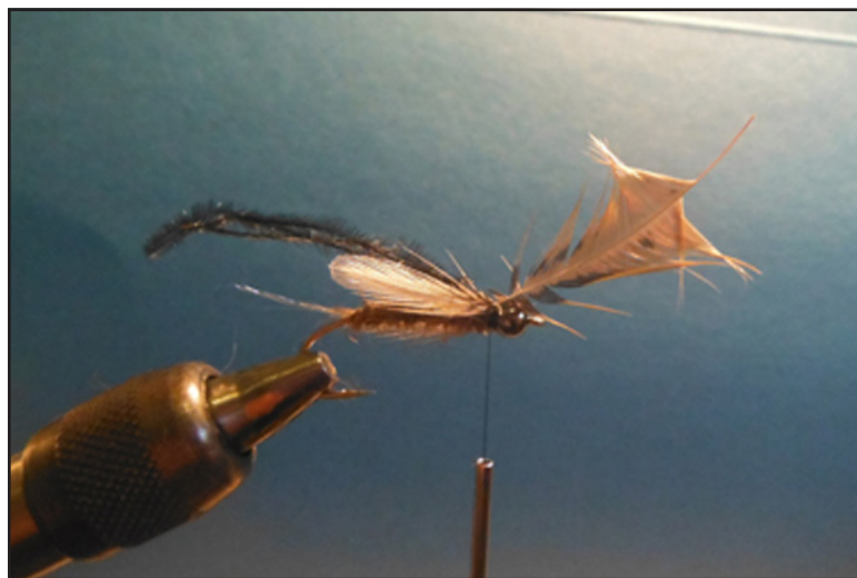
Steps 6, 7 and 8