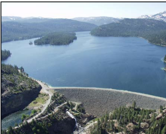
Jackson Meadows Reservoir