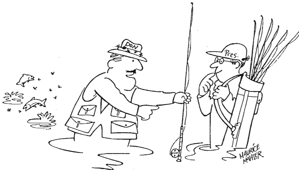
GIMME A SIX FLOATING

Several events coming up in the fall are: beginning fly tying, rod building, and perhaps a net building class, and several fly tying demonstrations. Let me know if you are interested in doing any other projects.