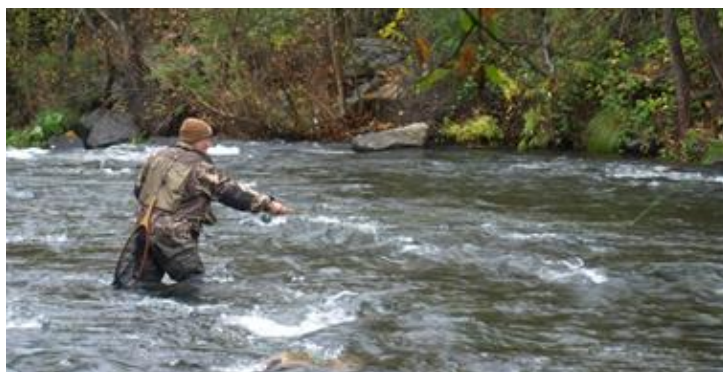
The short-line nymphing lob — not pretty, but very effective.

But, how the heck can we catch trout while standing right on top of them without spooking them? It's easy. Short-line nymphing is a pocket water technique; that highly agitated water just below large rocks and boulders with the boiling, frothy dense cover fish crave. It provides safety and security from predators in a zone with abundant oxygen, cold temps and an infinite conveyor belt of food drifting right by their nose. What's not to love about that if you're a trout? If they only knew what clever schemes fly fishermen have contrived to fool them. It's almost enough to make you feel guilty.