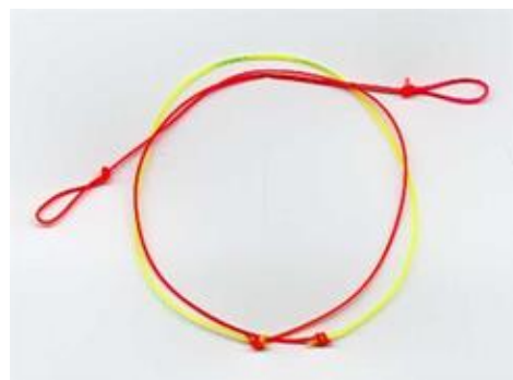
Ron Rabun's Amnesia indicator, 1978

Ron found through trial and error that raising the rod handle to the horizontal immediately following the lob, then adjusting the angle of attack of the leader into the water to 45 degrees during the drift would increase the grab rate. At the end of the drift, Ron added a trial hook set with a horizontal twitch toward the bank in the hope that a fish just might have its mouth around the fly.